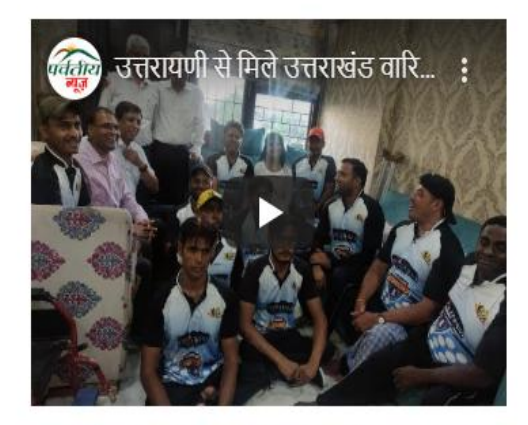
Uttarayani members with Uttarakhand warriers cricket players