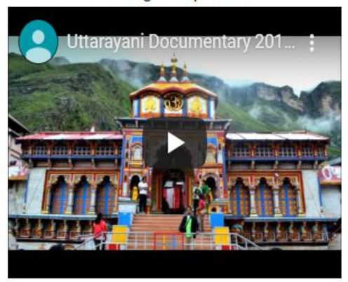
Uttarayani Documentary 2015 AGM

JOIN US IN THE WELL-BEING OF THE PEOPLE AND THE STATE OF UTTARAKHAND. THEREBY PARTICIPATE IN NATIONAL DEVELOPMENT.